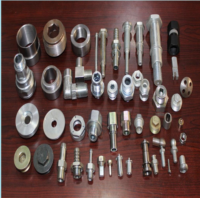
PRECISION MACHINING COMPONENTS