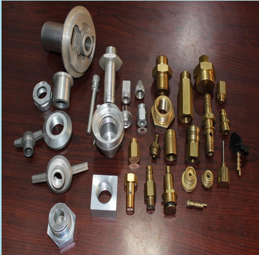
PRECISION BRASS ALUMINIUM COMPONENTS