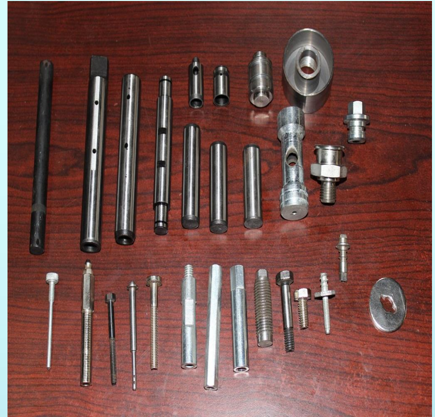
HYDRAULIC PRECISION SHAFT & COMPONENTS