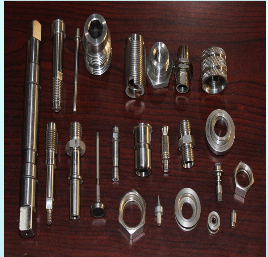
STAINLESS STEEL COMPONENTS