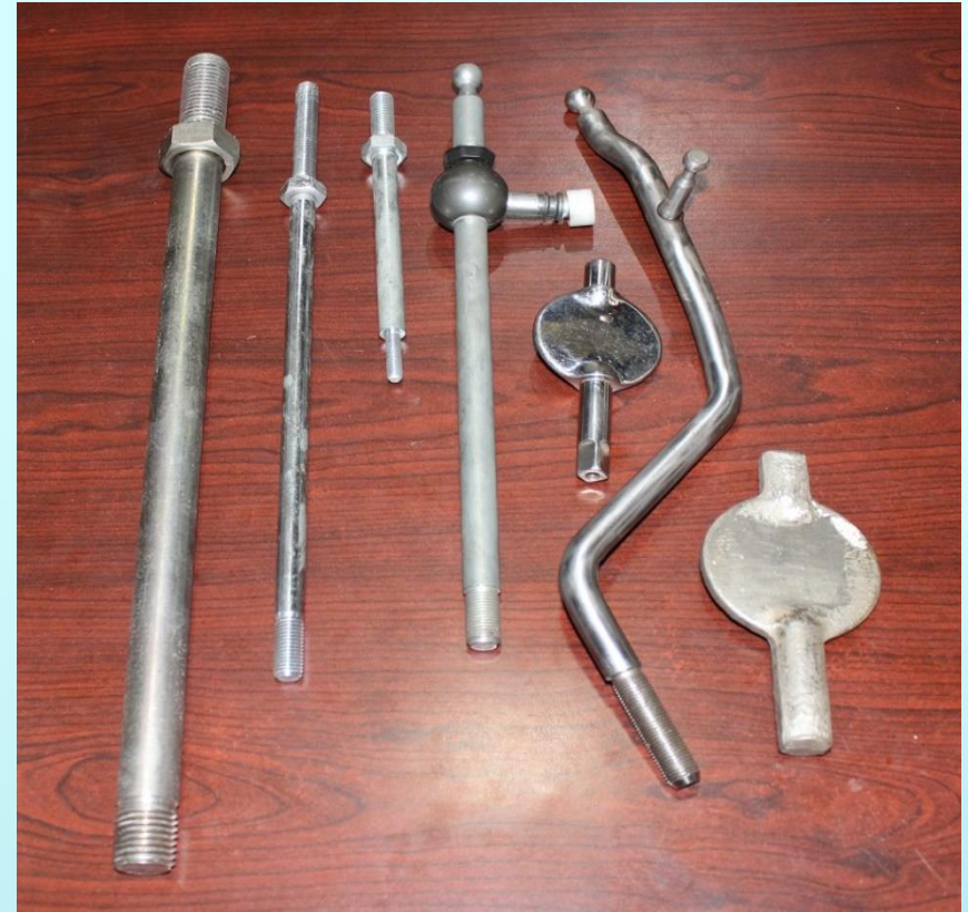
STUD GEAR SHIFTER ASSEMBLIES